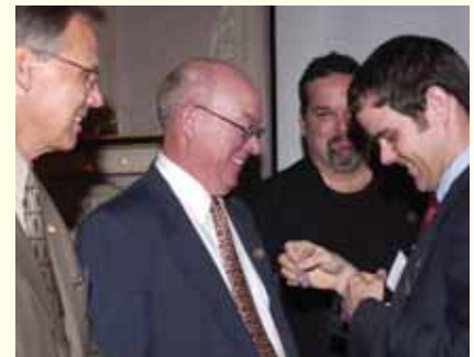
Order of 1892 Ceremony