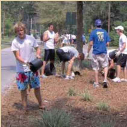
Potential Members spreading mulch at Community Service Recruitment Event

This last line from the Creed of the Chi Phi Fraternity was my personal mantra during the three-week expansion in Gainesville, Florida, for the restart of the Theta Delta Chapter. If it were not for these eight words, I may have lost focus, buckled under pressure, or just given up completely. I say this because I was truly going in with no idea of the amount of work or of the long hours it was going to take to make this expansion successful.