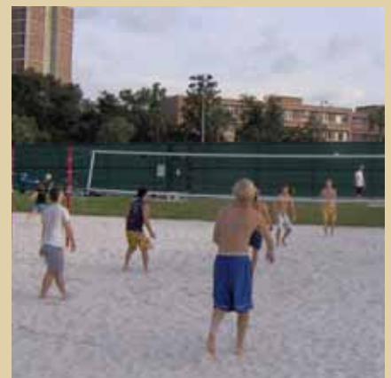
Potential members at athletic recruitment event