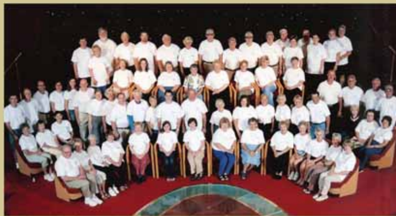
Passengers aboard the Inaugural Interfraternity Cruise in 2005

* Pricing is based on double occupancy, is subject to availability, and excludes port charges, taxes and airfare.